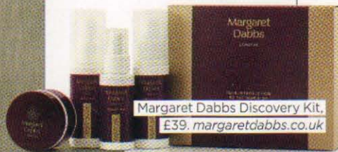
Margaret Dabbs Discovery Kit, £39. margaretdabbs.co.uk