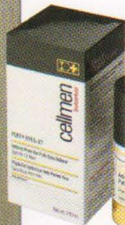
Cellmen Puffy Eyes XT, £110. feelunique.com

The wedding day signals some serious top-to-toe grooming for the groom. Banish any signs of the stag with a great eye cream, don't neglect the feet because flip flops and the honeymoon beach await, and dab on something seriously magnetic.