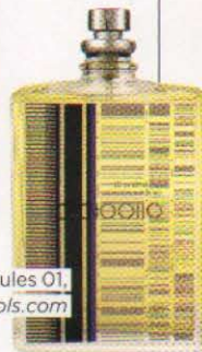
Escentric Molecules O1, £65.50. harveynichols.com