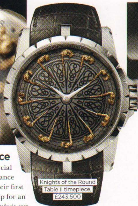
Knights of the Round Table II timepiece, £243,500

Geneva-based horological innovators Roger Dubuis holds a special place in the watch world, known for striking a delicate balance between traditional watchmaking and avant garde design. Their first London boutique has opened in Harrods – the perfect spot to shop for an extra special wedding gift that will stand the test of time. rogerdubuis.com